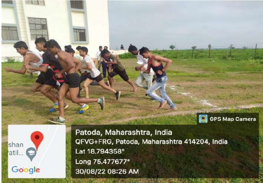
SPORTS: 400 MTRS RUNNING