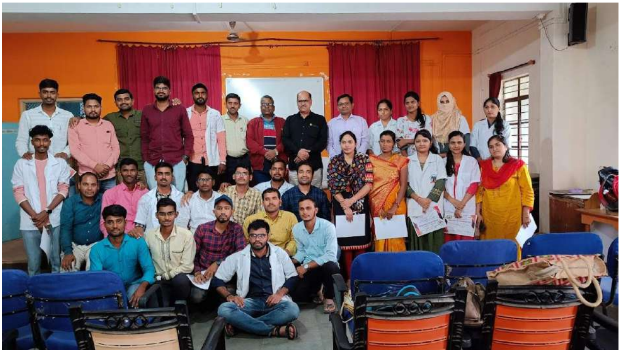
PARTICIPATION IN ADD-ON COURSES: CERTIFICATE DISTRIBUTION CEREMONY