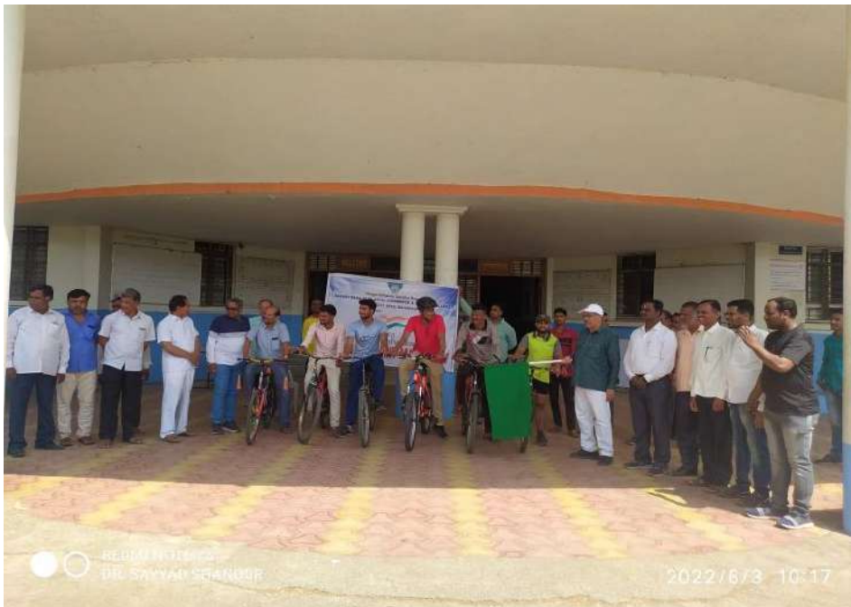
INTERNATIONAL BICYCLE DAY: BICYCLE RALLY