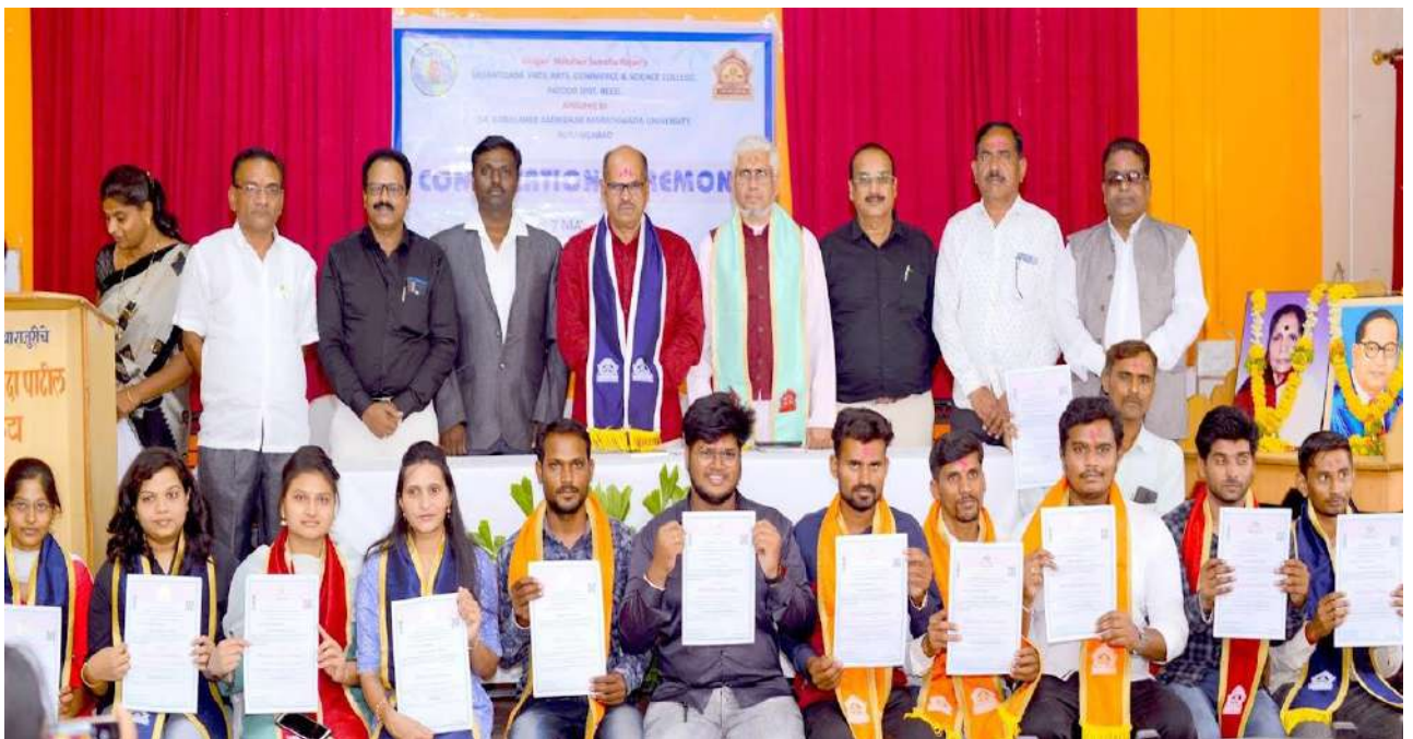
CONVOCATION CEREMONY AT COLLEGE