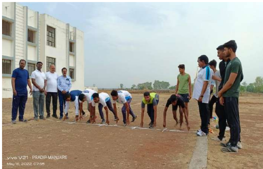
SPORTS: 400 MTRS RUNNING