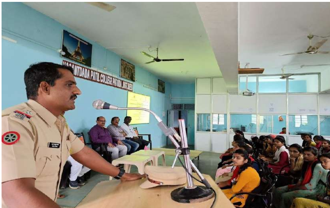
GUIDANCE ON LEGAL AWARENESS