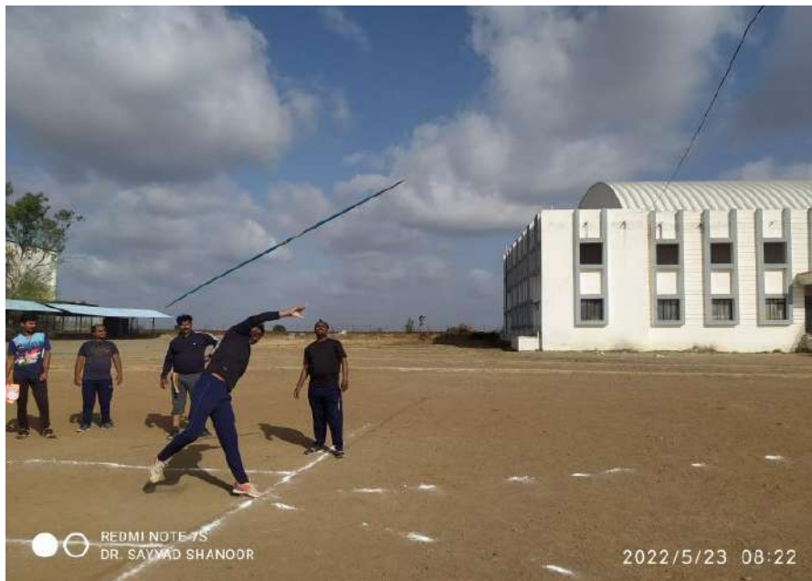
SPORTS: JUVELIN THROW