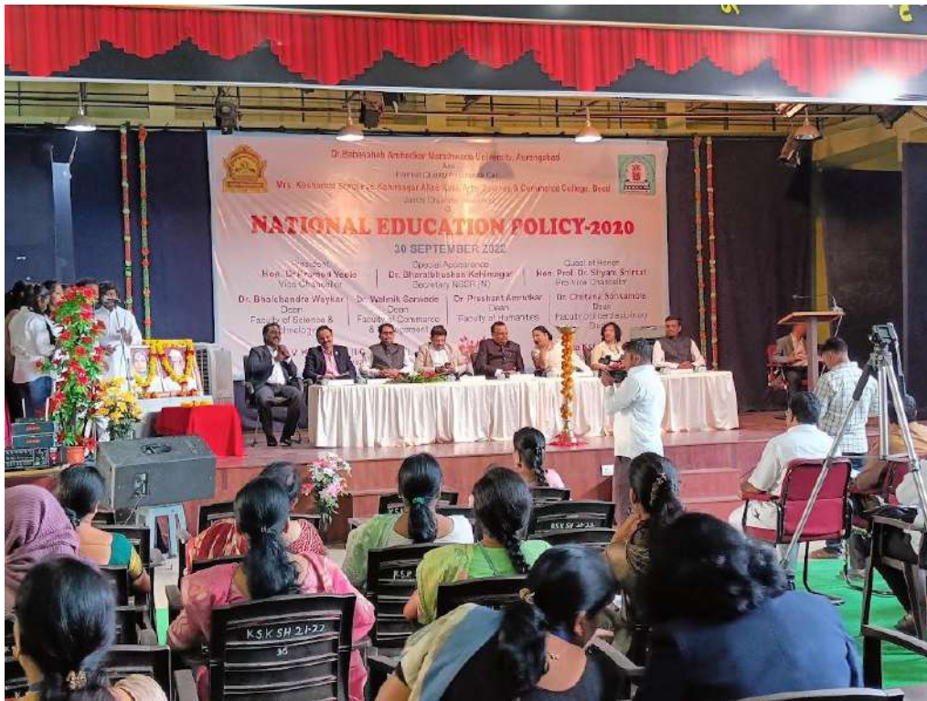
NEP-2020: COLLEGE PARTICIPATION IN NEP-2020 WORKSHOP