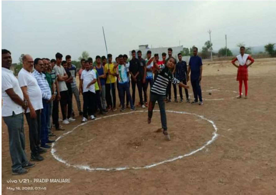
SPORTS: DISCUS THROW