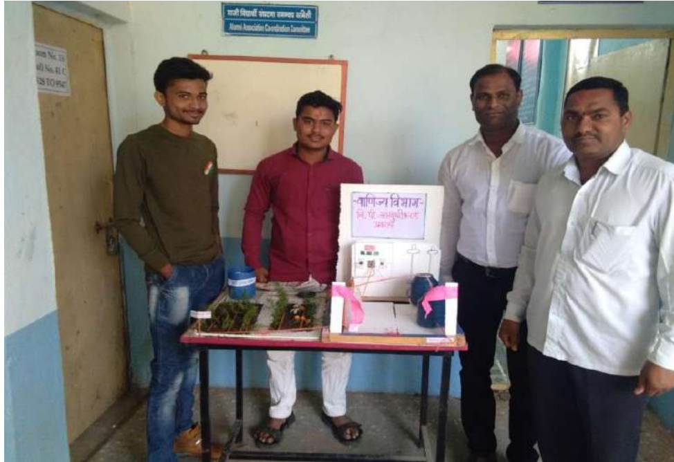
STUDENTS' PARTICIPATION IN EXHIBITIONS