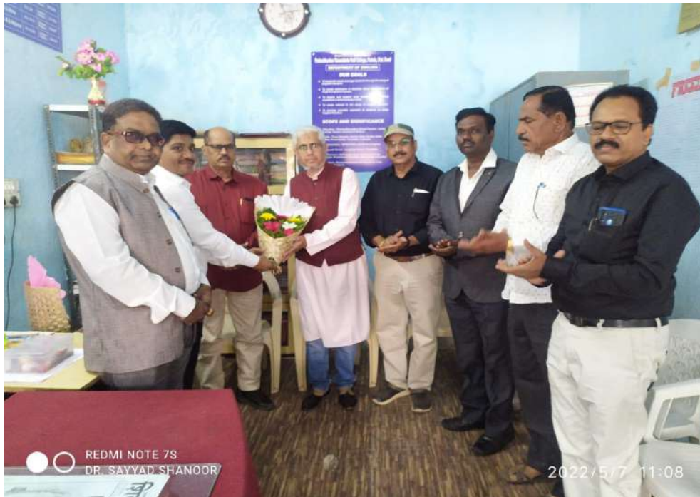
ADD-ON CERTIFICATE COURSES: INAUGURATION OF CRASH COURSE IN SPOKEN ENGLISH