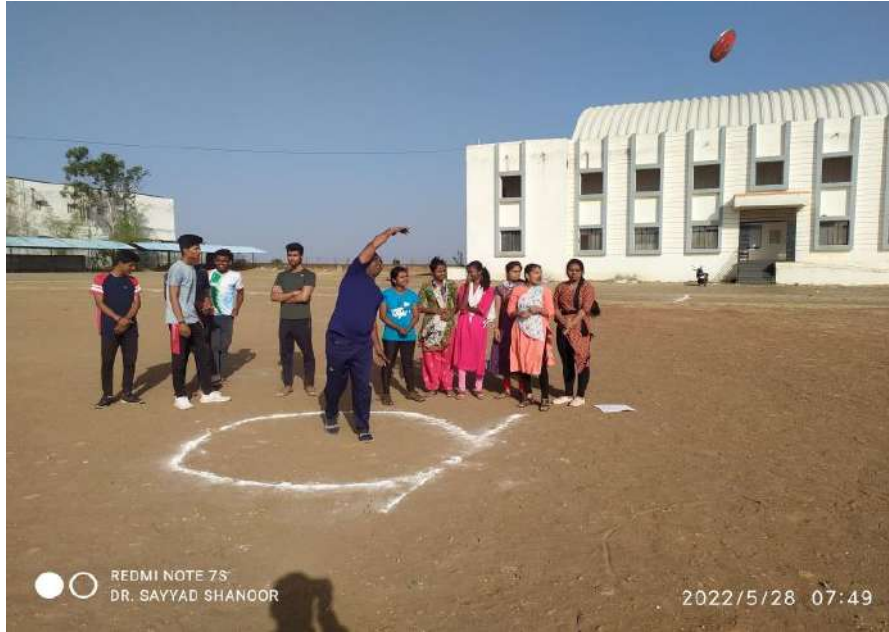
SPORTS: COACHING OF DISCUS THROW