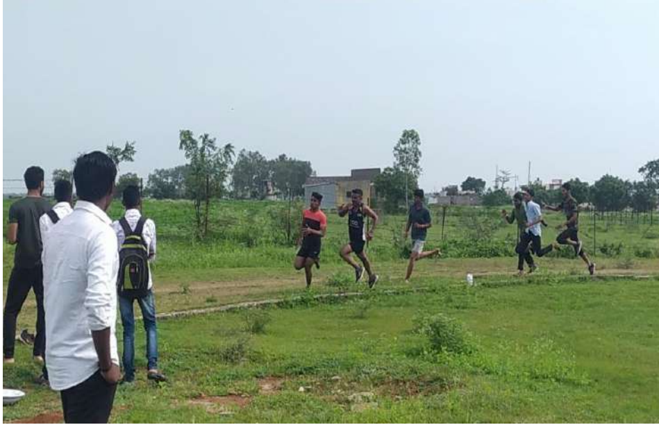
SPORTS:1600 MTRS RUNNING