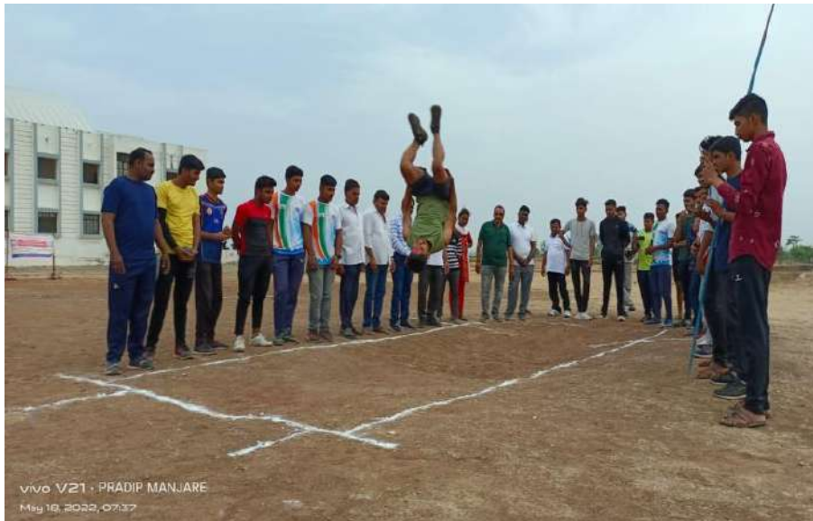
SPORTS: LONG JUMP