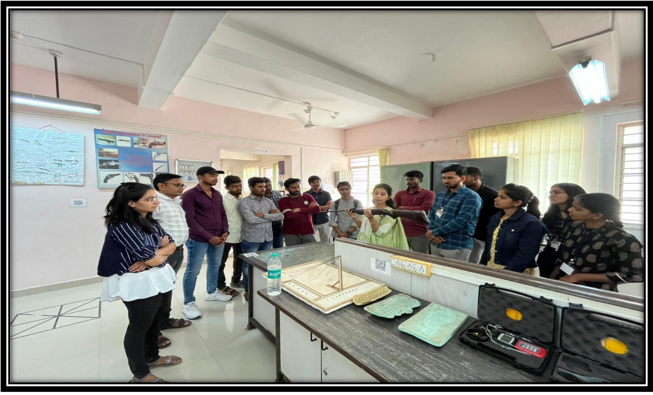
Study Tour at Government Forensic Science Department, Chha. Sambhajinagar