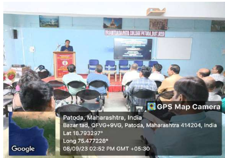
FACULTY ATTENDING THE GUEST LECTURE